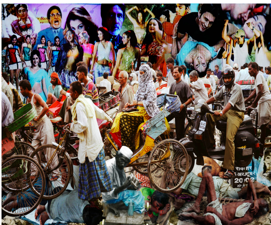
Street Madness (Crowded Streets of India), Neil Chowdhury