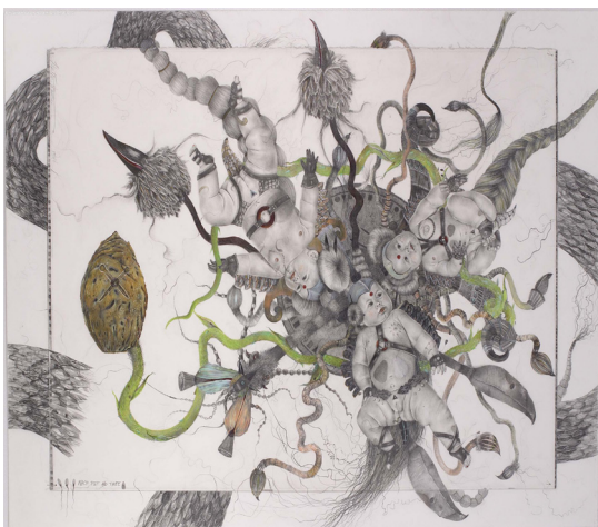
Peach Pit and Three, Heather Accurso